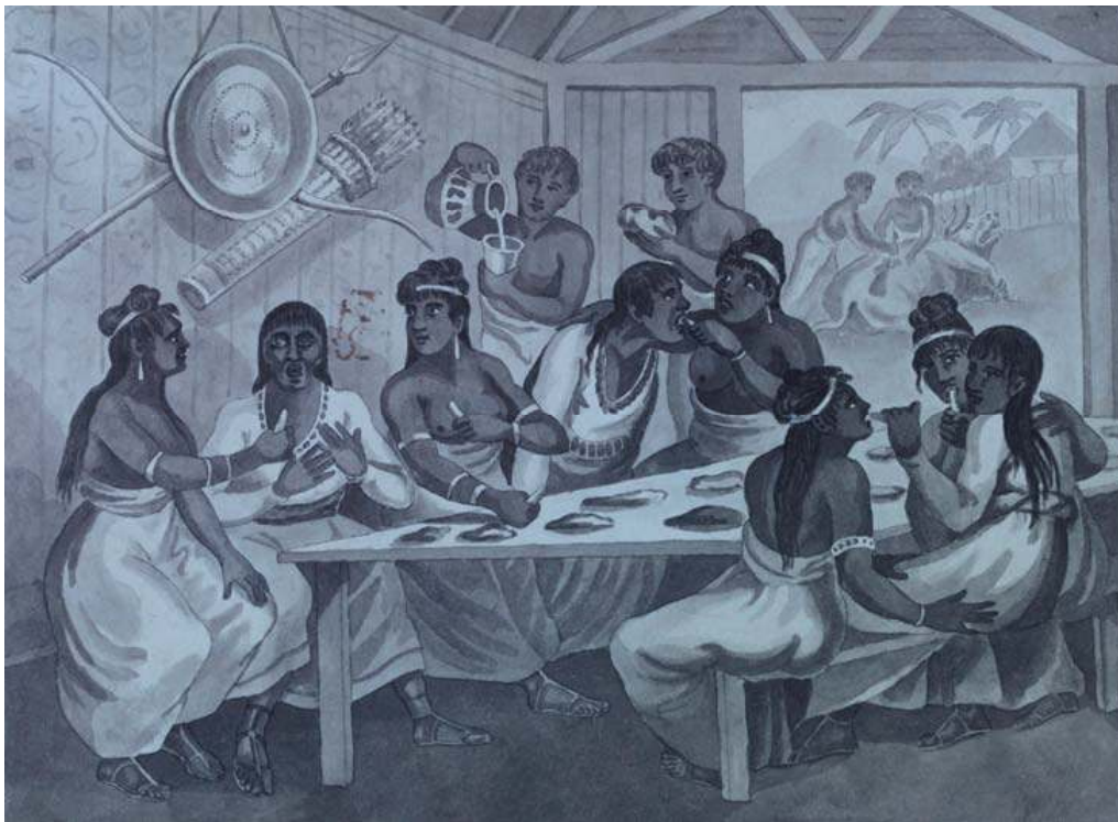
Figure 2 The Polyphemus Feast of the Abyssinians.

his travels more marvelous (Marsters, 2000). Mungo Park died in 1805 during his second expedition to Africa. He served throughout the 19 th century as an icon of the hero-explorer and as a model for many to follow. In accordance with the public image of the authors, Malthus treats Mungo Park's observations with the necessary respect and Bruce's account with a good dose of sarcasm and skepticism.